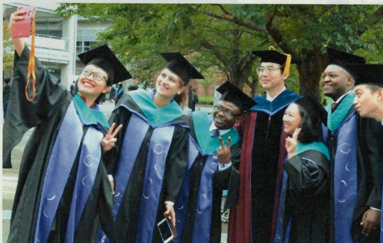
Graduation Ceremony for the Master's course