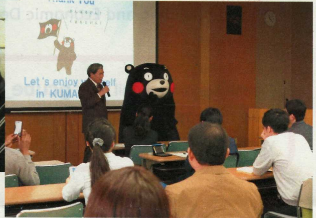
Lecture by Governor Kabashima of Kumamoto and meeting Kumamon in Kumamoto