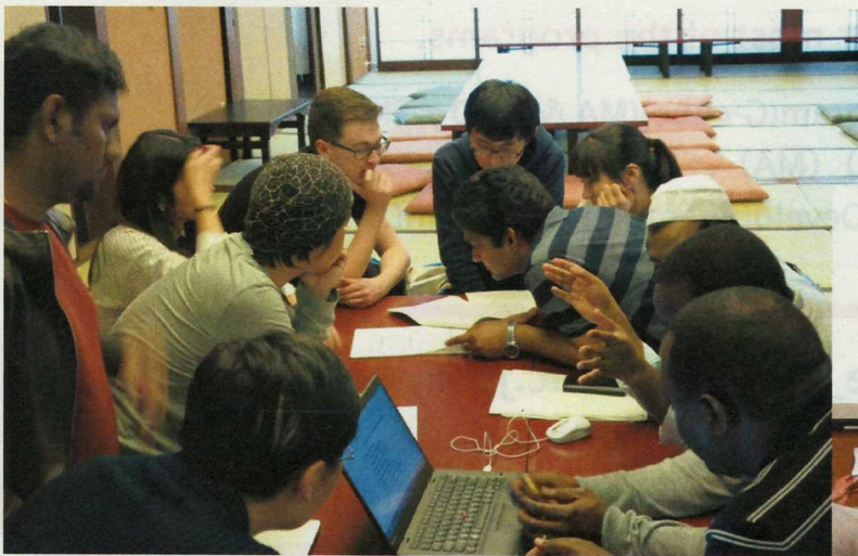
Study Camp with Kyushu University and Hiroshima University in Kyushu